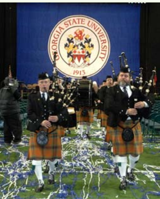
Fall 2008 Commencement