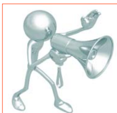
Byrdine F. Lewis School of Nursing