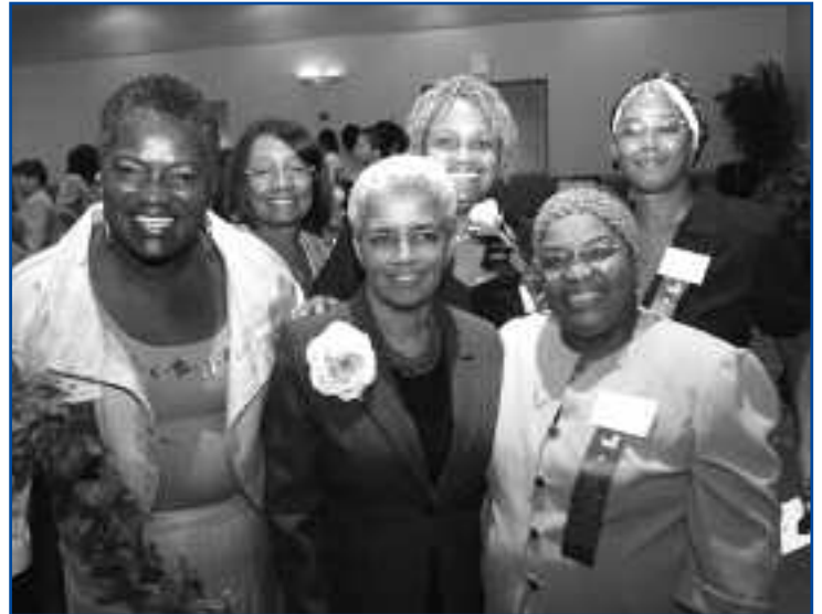
City of Atlanta Mayor Shirley Franklin took time out of her busy schedule to visit with a number of grandparents during the annual Project Healthy Grandparents luncheon. Mayor Franklin autographed programs and posed for photos after the formal luncheon program ended.