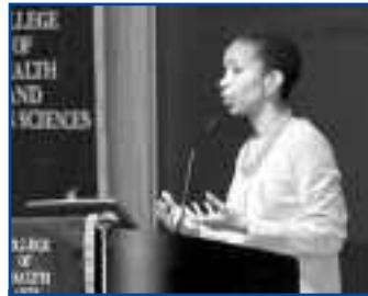
Dr. Helene Gayle, President and CEO of CARE USA

Dr. Helene D. Gayle, president and CEO of CARE USA, presented the 4th Annual J. Rhodes Haverty Lecture on October 26, 2006 at Georgia State University to the largest group to date of alumni, donors, faculty, staff, and students. Dr. Gayle discussed the global impact of HIV/AIDS on women and children. With programs in 70 countries, CARE is one of the world's premier international relief organizations. CARE assists millions of people in recovery from natural disasters, prevention of HIV/AIDS, and gaining access to healthcare, education, safe water, and improved sanitation. In recent months, CARE has been instrumental in providing humanitarian relief to war-torn Beirut.