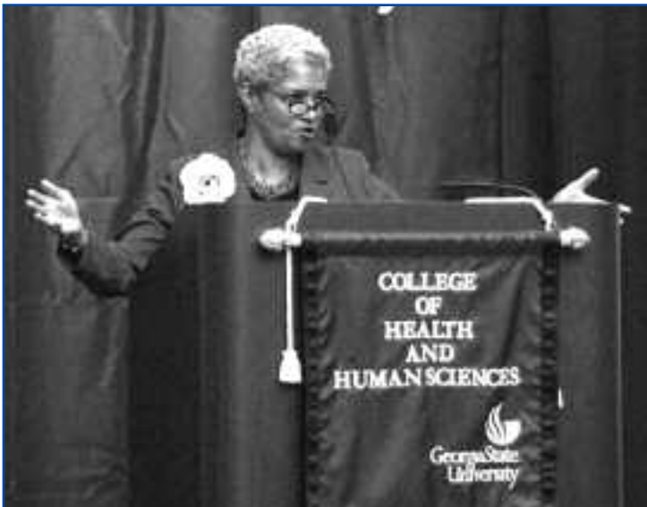
City of Atlanta Mayor Shirley Franklin delivers the keynote address at the annual Project Healthy Grandparents luncheon.